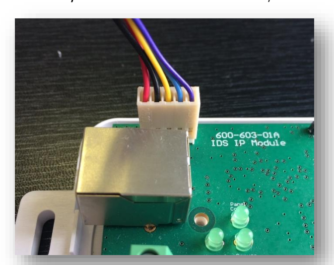
Tip: The red wire on the X-Series panel should be closest to the panel's heat sink.

Connect the provided serial cable from the serial connector on the X-series panel to the serial connector on the HYYP IP Connect Module.